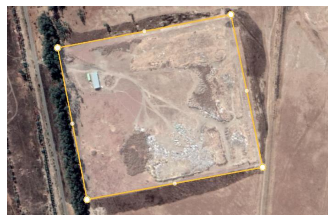
Figure 1 – Dannhauser Landfill Site

Existing fence is broken/ damaged for some time now and this is causing access control challenges. This is not in line with the licence regulations for a landfill site as it poses a danger to the community and the environment at large. Hence, Dannhauser Municipality is inviting potential contractors to tender for this work.